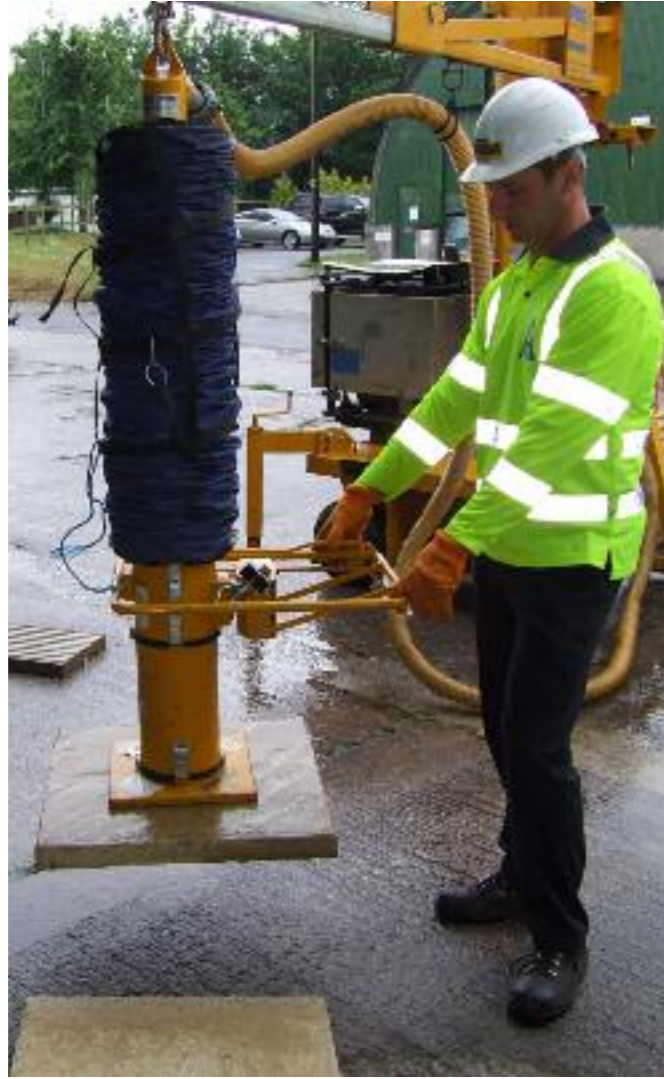
Vacuum pad lifting riven flag

Vacuum flag lifters can be a mobile self-powered lifter designer for one or two person operation. The mobile self-powered lifter has a boom arm to facilitate efficient installation in larger areas. With an appropriate attachment it is possible to pick up flags that are vertically stacked on the pallet and rotate the flag to a horizontal position ready for installation. As with the kerb vacuum devices the vacuum pump is usually powered by a rechargeable battery.