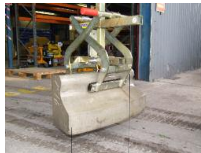
Trief Cadet Kerb unit 117kg

Mechanical grabs are activated either hydraulically or by relying on the mass of the kerb to activate the gripping bars by scissor action. This equipment is used in conjunction with existing site construction plant that is certified to lift heavy loads such as a backhoe or excavator.