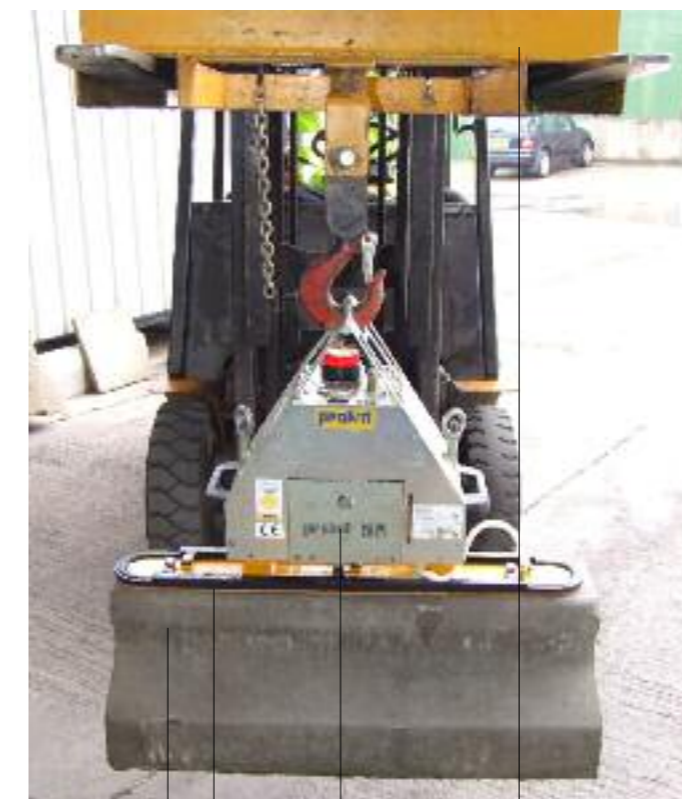
Trief Cadet Kerb unit 220kg

Whereas re-positioning can be necessary when using a mechanical lifting clamp - to allow access for side clamps - a key advantage of vacuum lifters is that they allow product to be lifted directly from the pallet without the need for prior repositioning. One fewer handling process means faster handling with less risk.