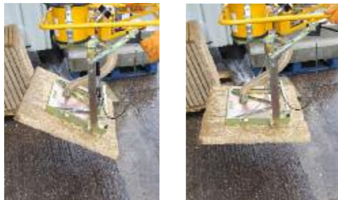
Sequence shows vertically stacked flags brought to horizontal position using vacuum lifting machinery